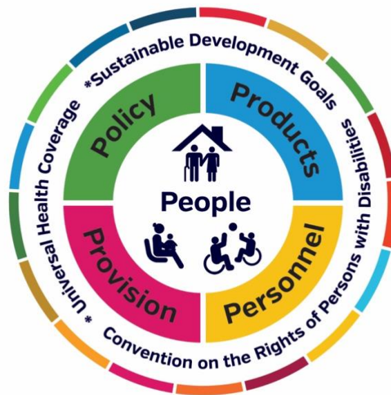
Figure 1. Diagram of the World Health Organization AT system model.

Participants exchanged experiences and challenges encountered in measuring and evaluating AT Outcomes and Impacts. We used a global consultation process to consolidate and further refine those challenges.